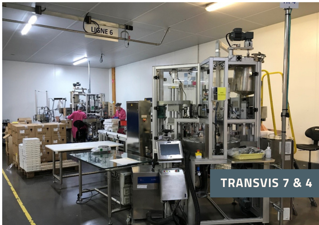
TRANSVIS 7 & 4